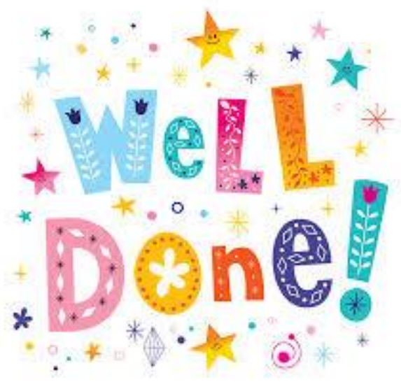
A look into our week at Wharton CE...